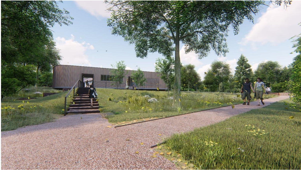
Figure 2 Tree Health Centre visitor entrance impression by SALT Architects